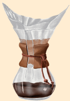
Pour Over Coffee Preparation Illustration